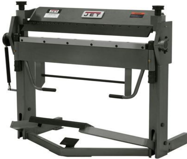
(Figure 3): Box & Pan Brake

to be “extended” until it is at least 1.002X \rho -Length to prevent Spring Back . Thus a reduction in the \rho -Length of 2% is required to make the Bend Allowance come out correctly for Parts formed in this manner.